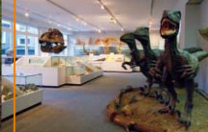
Fuhlrott Museum Interesting facts about the nature of the Rhineland