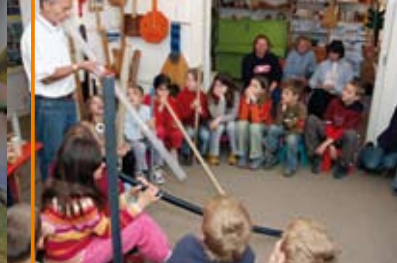
Childrens Museum Wuppertal Fantastical musical instruments and more