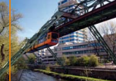
A journey with the suspended railway Wuppertal's landmark stops at the zoo