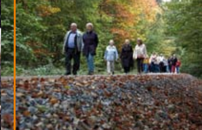
Samba-Trasse The new walking and cycling path leads through the zoo